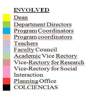
Figure 1. List of those involved.

For the analysis of those involved, the group of actors that have an interest in the development of the projects, directly or indirectly, is determined internally and externally; Figure 1 shows the list of those involved analyzed. Based on this information, a prioritization of the stakeholders is carried out, determining the relation power/interest, influence/power, considering four variables. Degree of interest, power, influence and impact, as illustrated in Figure 2 and Figure 3.